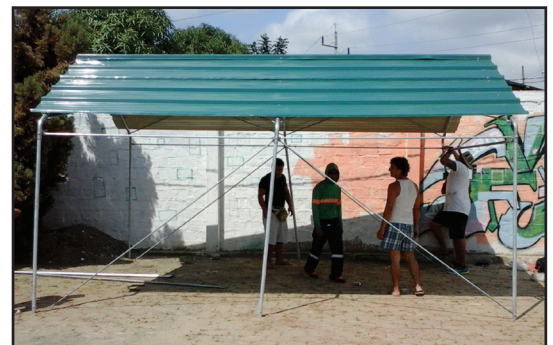
A tent is going up on the plaza of Our Lady of Merced.

Because of the generosity of our supporters, we are helping rebuild the city, one home at a time. The new homes are earthquake resistant and have withstood